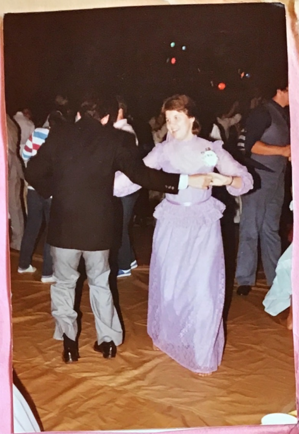
Spring Formal 1983