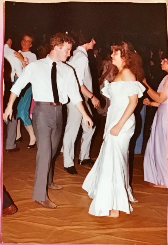
Spring Formal 1983