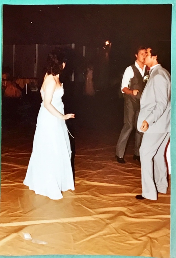
SPRING FORMAL 83.