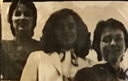
MISS YOUNG HARRIS COLLEGE WINNERS